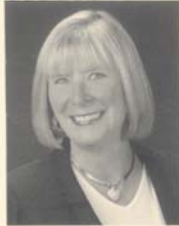
"Top 10" State of Florida

3320 N. Federal Highway • Lighthouse Point, FL 33064